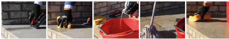
PIC 1. Fill joint with grout.